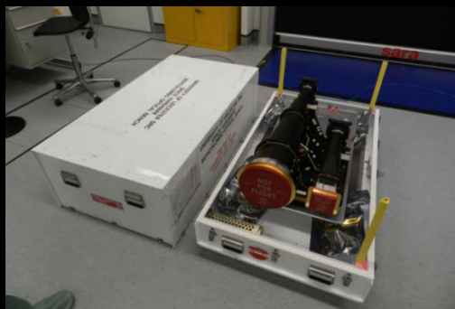
Bepi Colombo - 2018