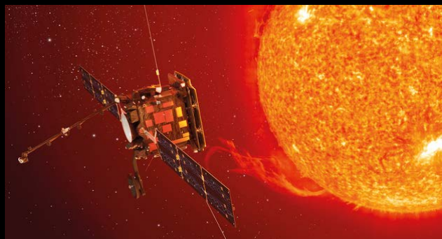
Solar Orbiter - 2018