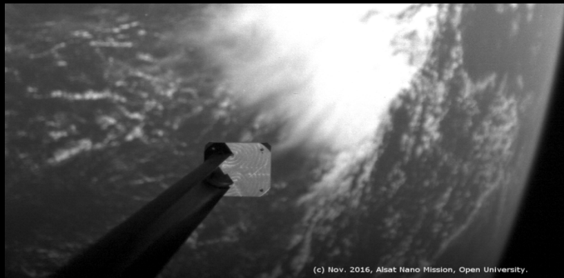
Alsat Nano – Nov 2016