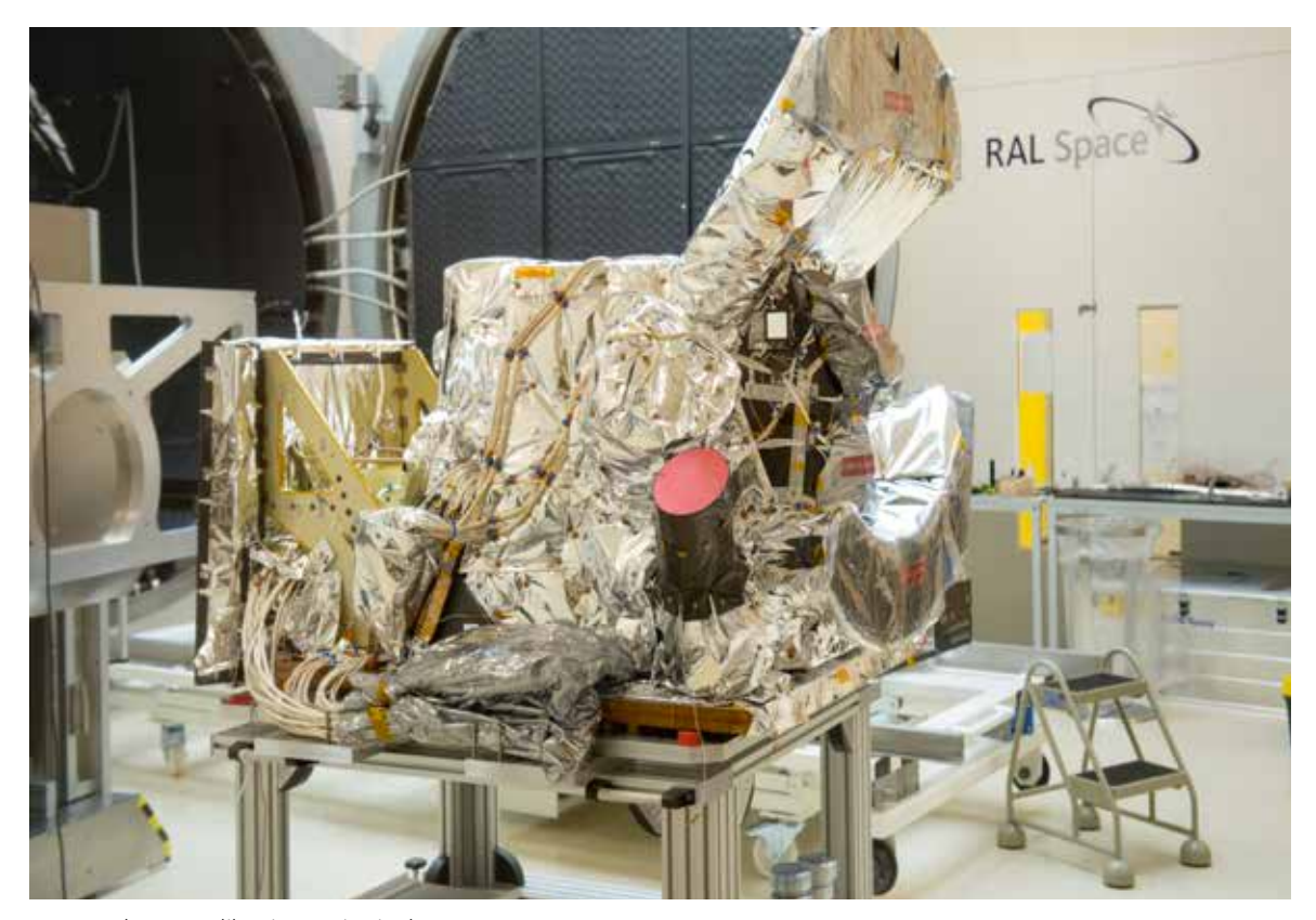
SLSTR undergoes calibration testing in the UKCCSI

The Centre provides a coherent programme structure, effective management development and future investment. RAL Space runs this facility with the close involvement of other expert UK academic and industry teams.