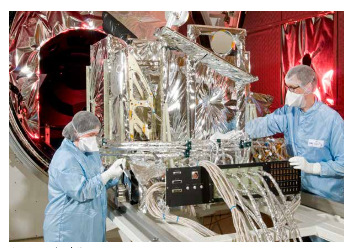
The Environmental Test facility at RAL Space

These facilities are available for use by industry and universities.