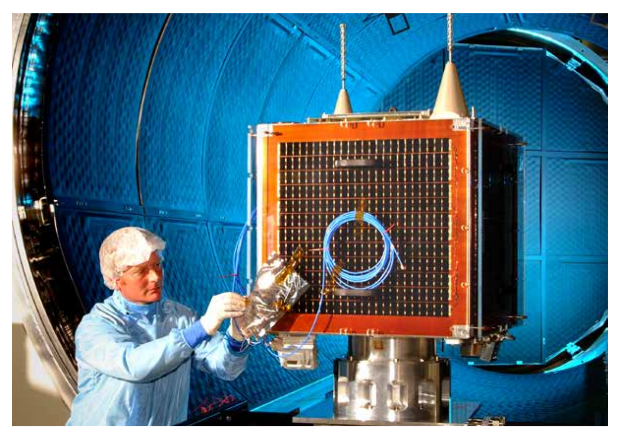
A DMC Satellite from SSTL is tested in the AIT at RAL Space

A facility designed to meet the exacting needs of those required for the testing of small satellites, with the ability to test multiple items in a single facility to offer a cost saving to projects and customers.