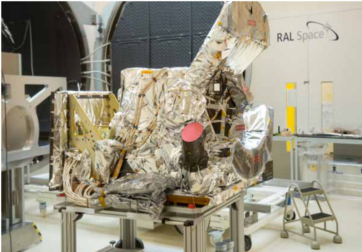
SLSTR undergoes calibration testing in the UKCCSI

The Centre provides a coherent programme structure, effective management development and future investment. RAL Space runs this facility with the close involvement of other expert UK academic and industry teams.