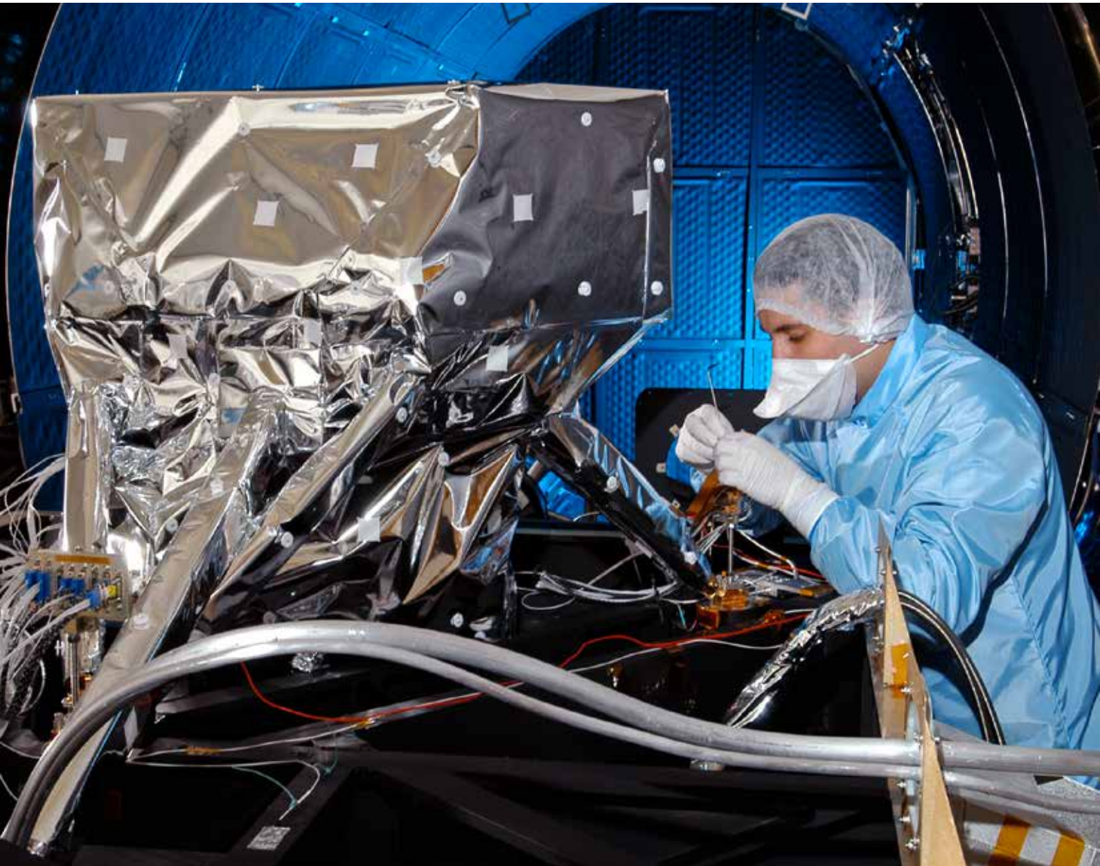
The Mid Infrared Instrument (MIRI) is tested in RAL Space