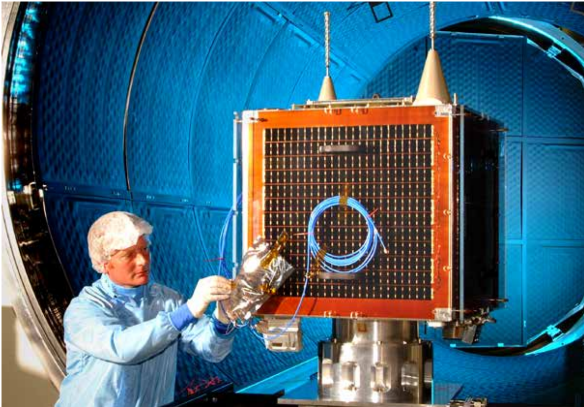
A DMC Satellite from SSTL is tested in the AIT at RAL Space

A facility designed to meet the exacting needs of those required for the testing of small satellites, with the ability to test multiple items in a single facility to offer a cost saving to projects and customers.