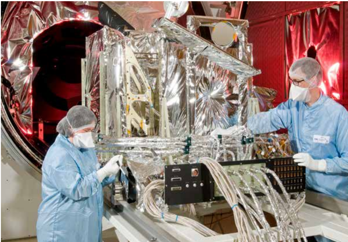
The Environmental Test facility at RAL Space

These facilities are available for use by industry and universities.